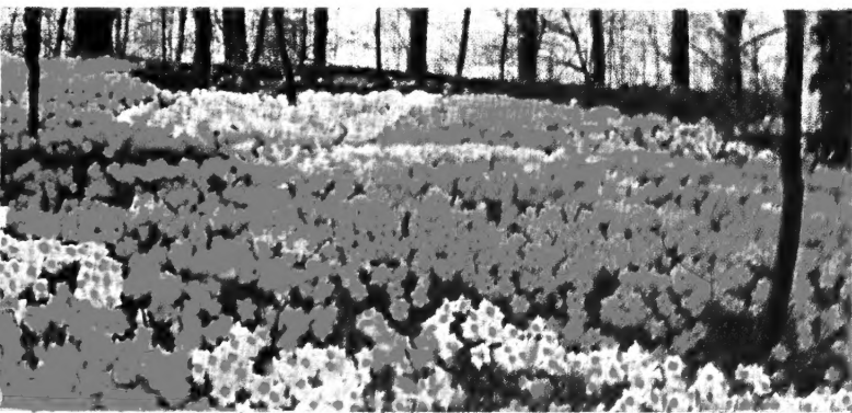
THE PINK DAFFODIL 12 for $2.50